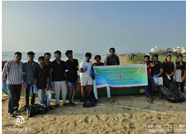
21.09.2019 - Students involved in the Beach Clean up