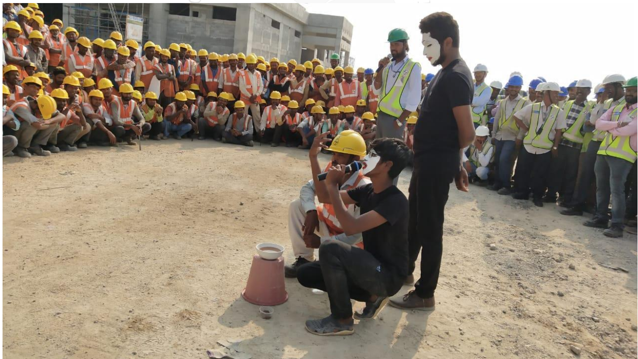
09.11.2019 - Student explaining the Importance of Clean Habits for a Healthy Living at Kalpakkam