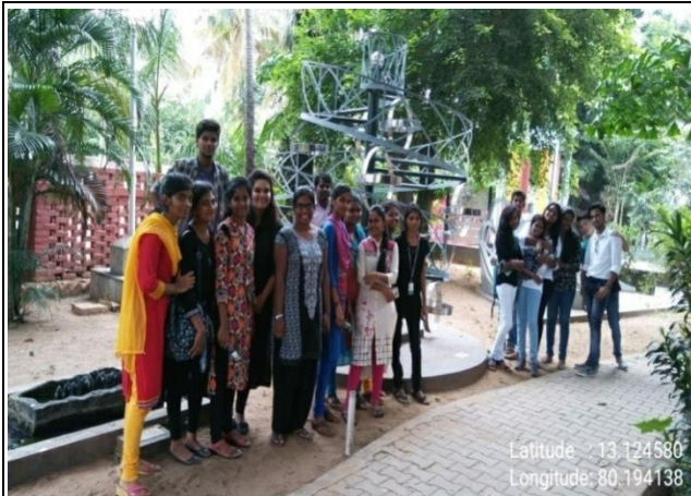
07.09.2019 - visit to Sishu Bhavan to create an awareness about the importance of Literacy