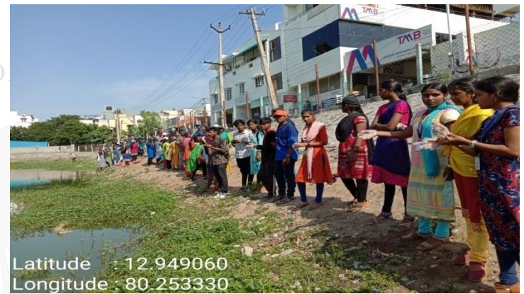
14.09.2019 - Dhobi Pond cleaning in process at Neelankarai