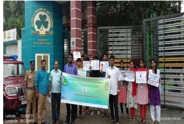
11.11.2019 - Rally On Aids Awareness And Ageing Issues