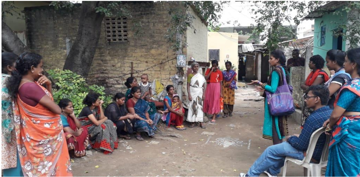
06.08.2019 - Awareness Program on Food and Nutrition to the Gypsy Women, Kotturpuram