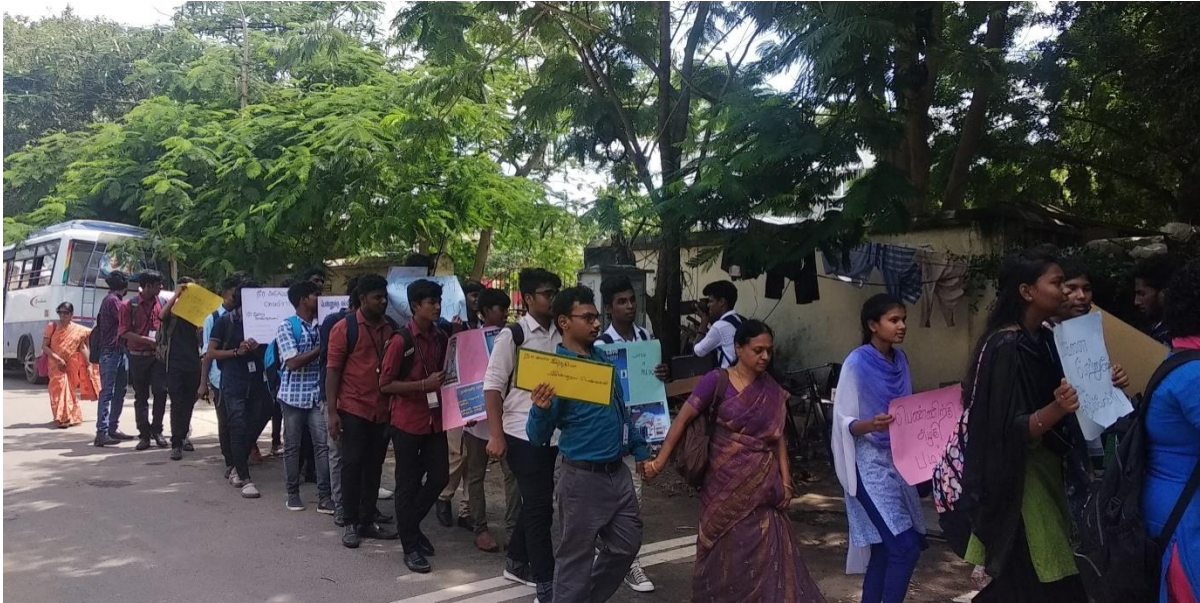
01.08.2019 - Water Conservation Rally at Kotturpuram