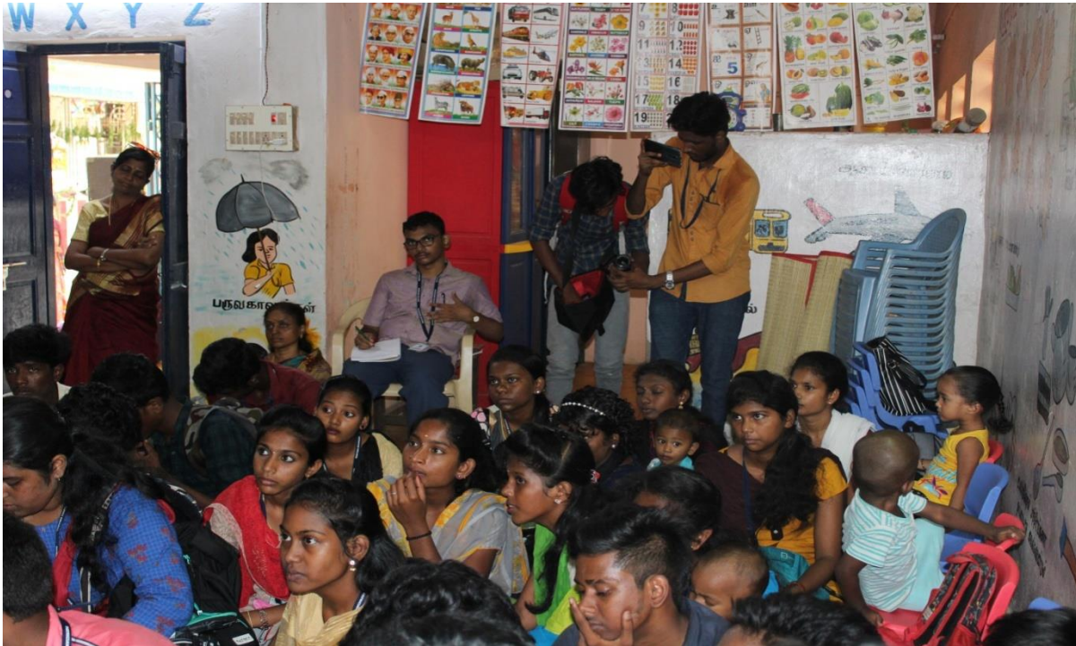
01.08.2019 - Interaction with Kotturpuram ICDS children