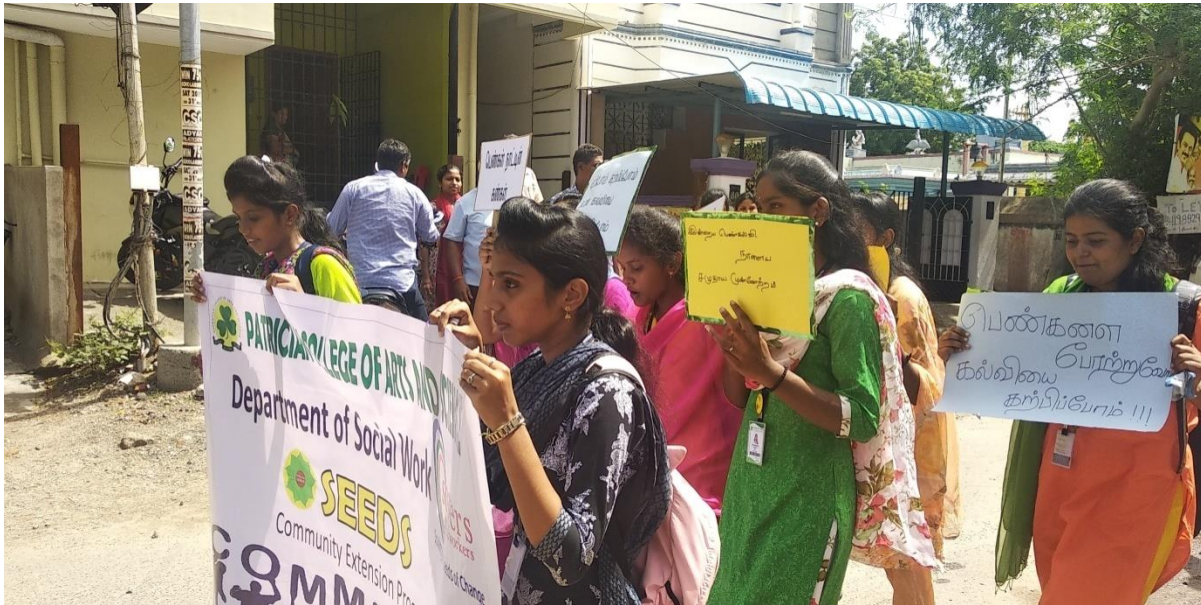
01.08.2019 - Garnering Support for the Girl Child Education at Kotturpuram