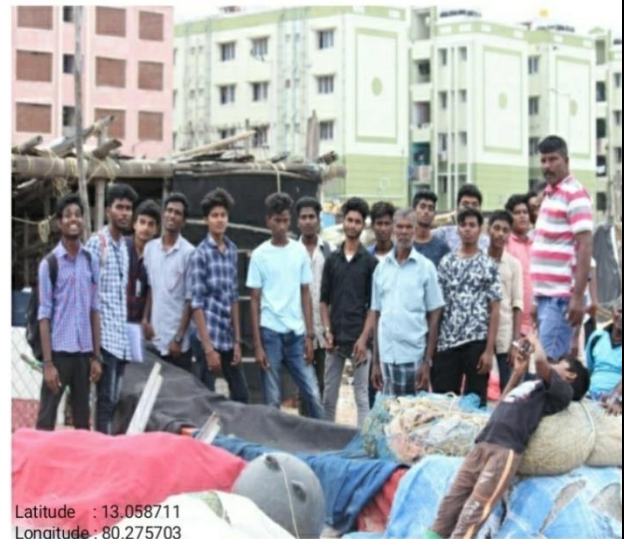
03.08.2019 - Cleaning Activity taken up at Dooming Kuppam