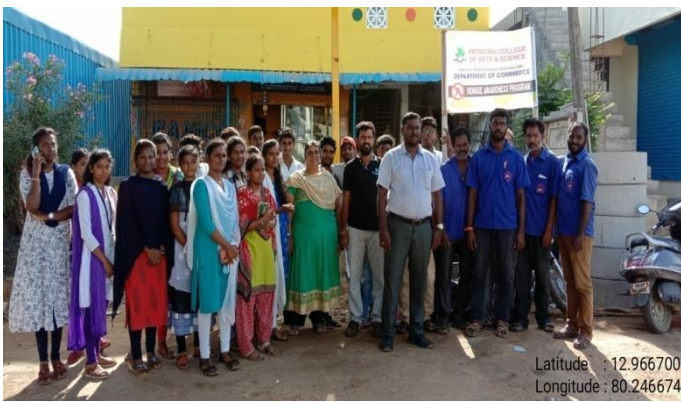
08.09.2019 - Dengue Awareness Program at Perungudi