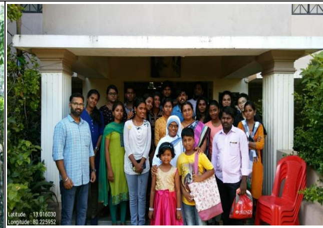
07.09.2019 - visit to Sishu Bhavan to create an awareness about the importance of Literacy