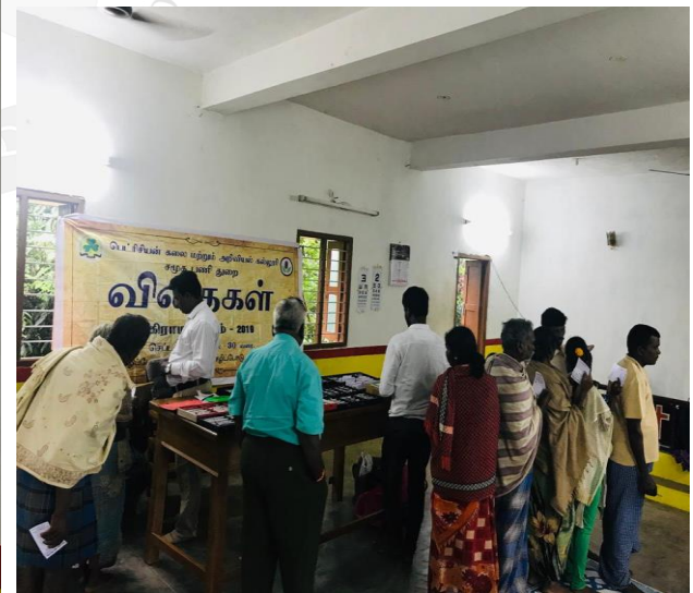
22.11.2019 - Students helping Doctors during the Eye Camp at Mundiur Village