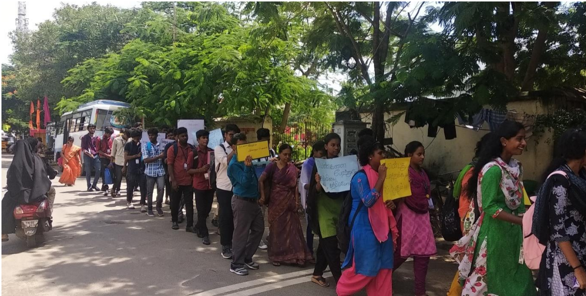
10.08.2019 - Students during a Rally on Cleanliness at Kotturpuram