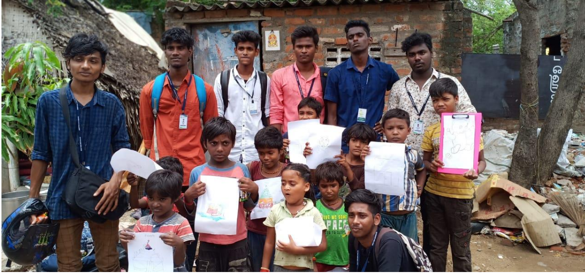
17.08.2019 – Gypsy Colony Children displaying their drawing talents at Kotturpuram