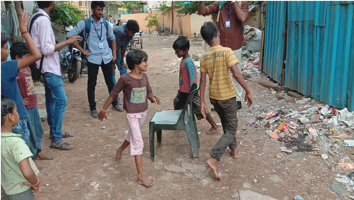
19.08.2019 - Quiz and Games for the Gypsy Children at Kotturpuram