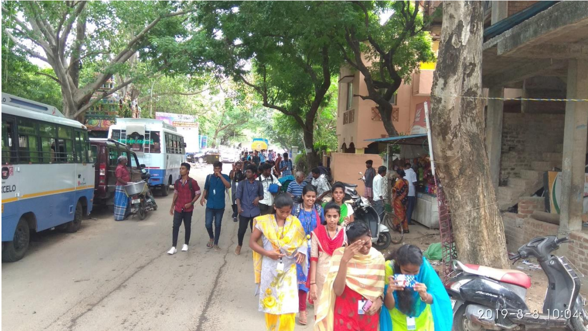
30.07.2019 - Transect Walk at Kotturpuram by the students