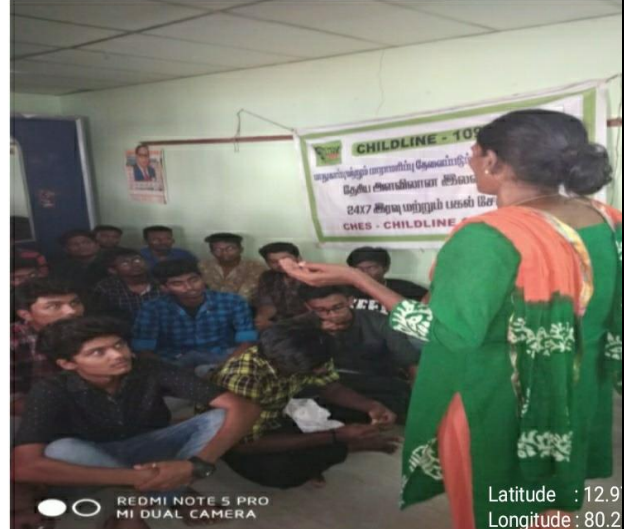
27.07.2019 - A student explaining on the Child Helpline