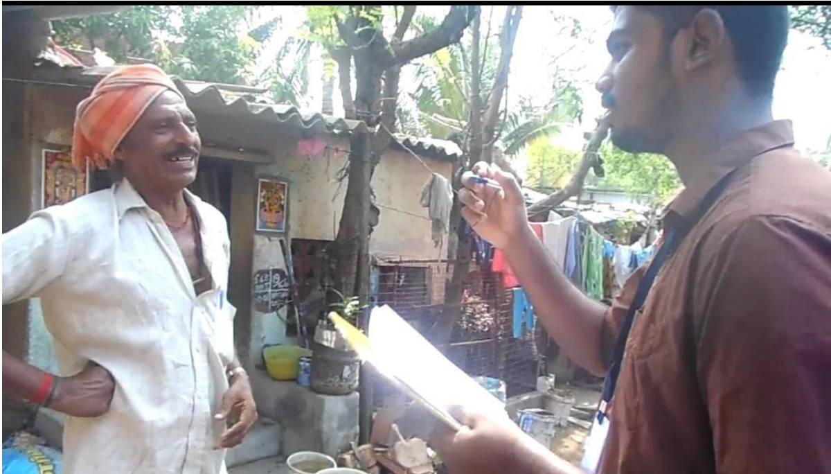
29.08.2019 - Gypsy Colony - Community Analysis by the Students at Kotturpuram