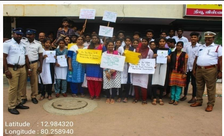
31.08.2019 - Helmet Awareness Program in Progress at Thiruvanmiyur Signal

Latitude : 12.984320 Longitude : 80.258940