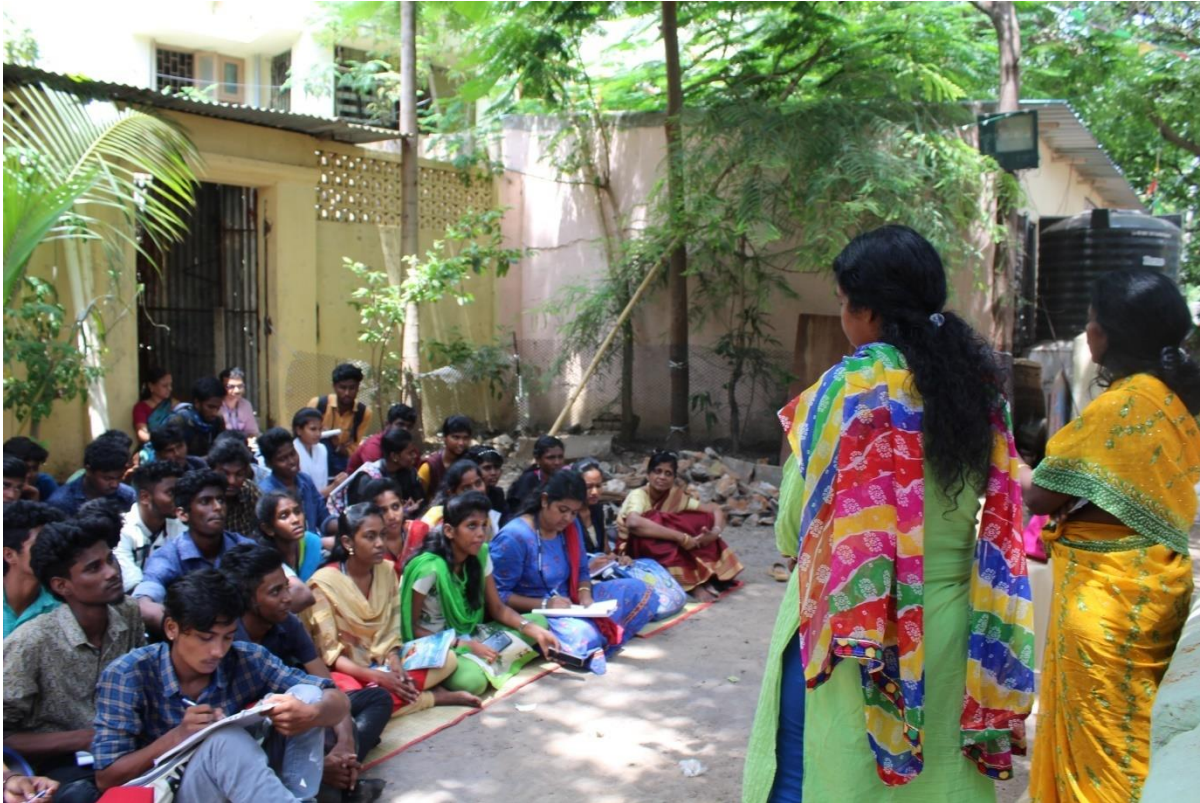
13.08.2019 - Interaction with the SHG Women of Kotturpuram