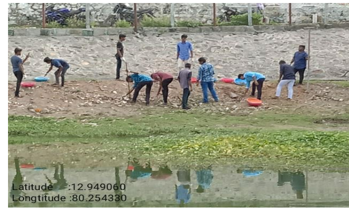
14.09.2019 - Dhobi Pond cleaning in process at Neelankarai